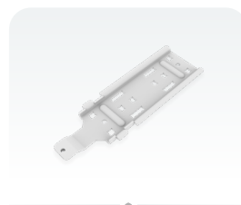
Outdoor case bracket