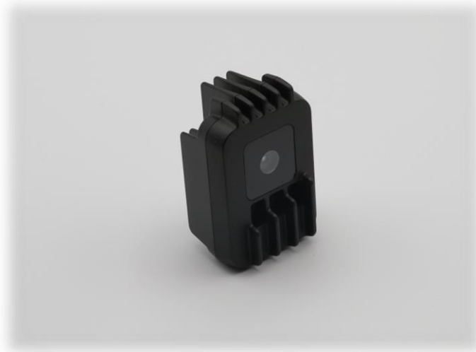
Figure 1 – OAK-1 Lite